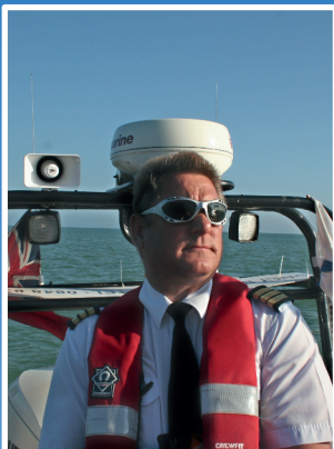
Sussex Voyages are members of the Professional Boatmen's Association & Eastbourne Hospitality Association (EHA)