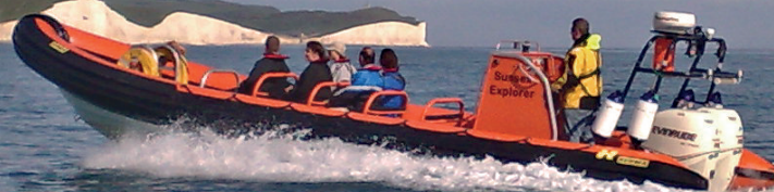
Seven Sisters Cliffs part of the South Downs National Park

We also offer Private Charter sailings for Language Schools, Corporate Events and Birthdays