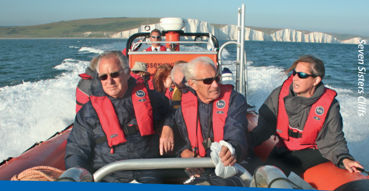
Seven Sisters Cliffs