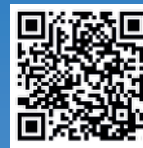
View our Sailing Times via this 3D barcode

For more information and times visit our web site at www.sussexvoyages.co.uk or scan this 3D barcode via your smartphone to go directly to our sailing dates & times.