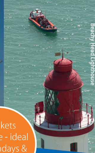
Beachy Head Lighthouse

E-tickets available - ideal for birthdays & gifts for special days